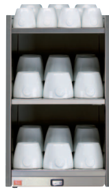
cw Cup warmer