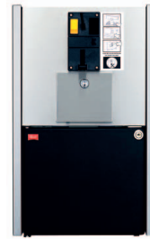
mc-mp Pay system and milk cooler