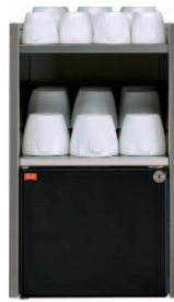
mc-cw Cup warmer and milk cooler