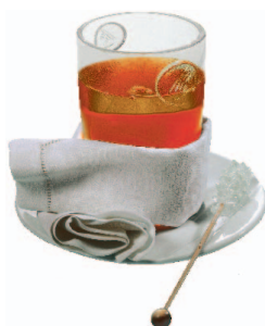
Hot water for tea